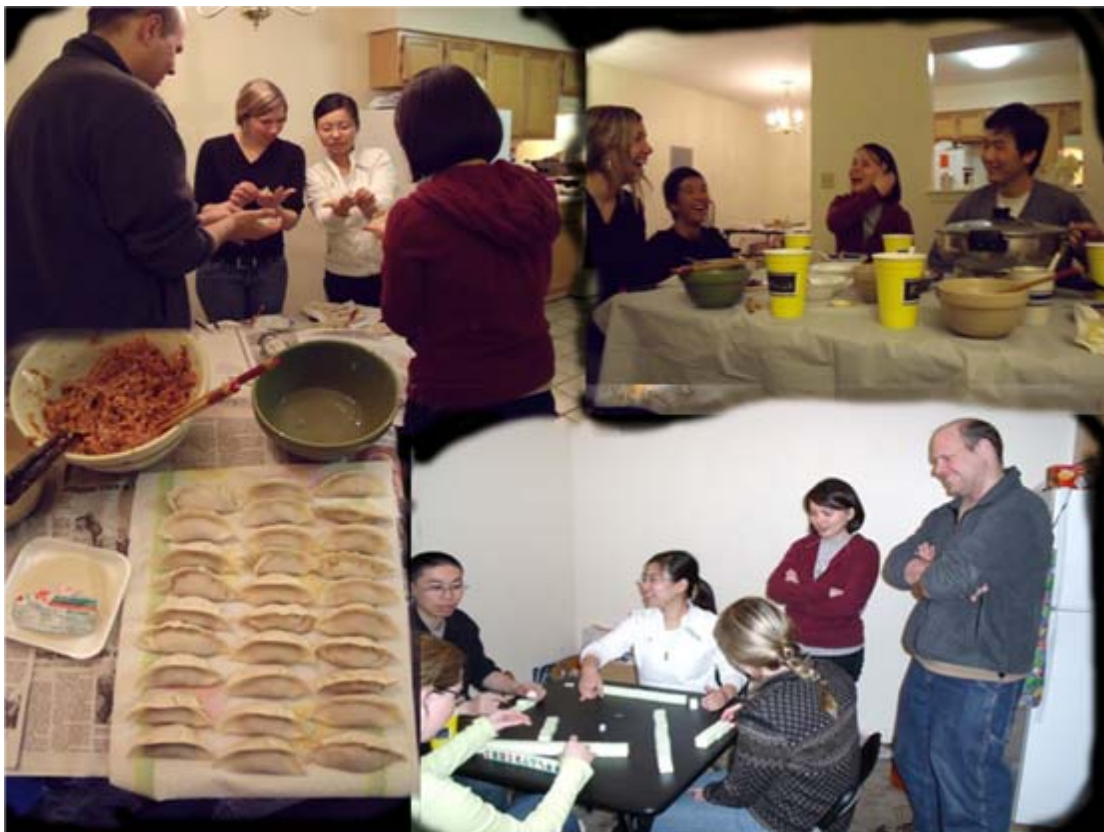
Students at Dumpling Night

Dumpling Night was initiated by several Chinese students in March, with dumplings and hotpot on the menu. An old Chinese saying goes: "those who don't labor don't get to eat". As a result, all the guests invited to the party were required to make their own dumplings from flour dough and dumpling stuffing. And, of course, a brief training was provided to American students in the very beginning. Steamy hotpot was also served with dumplings in case someone failed the training and got really hungry. The party ended with people playing Mahjong, the most popular game in China.