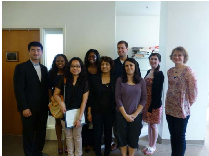
A few of our 2013 graduates at the Ice Cream Social