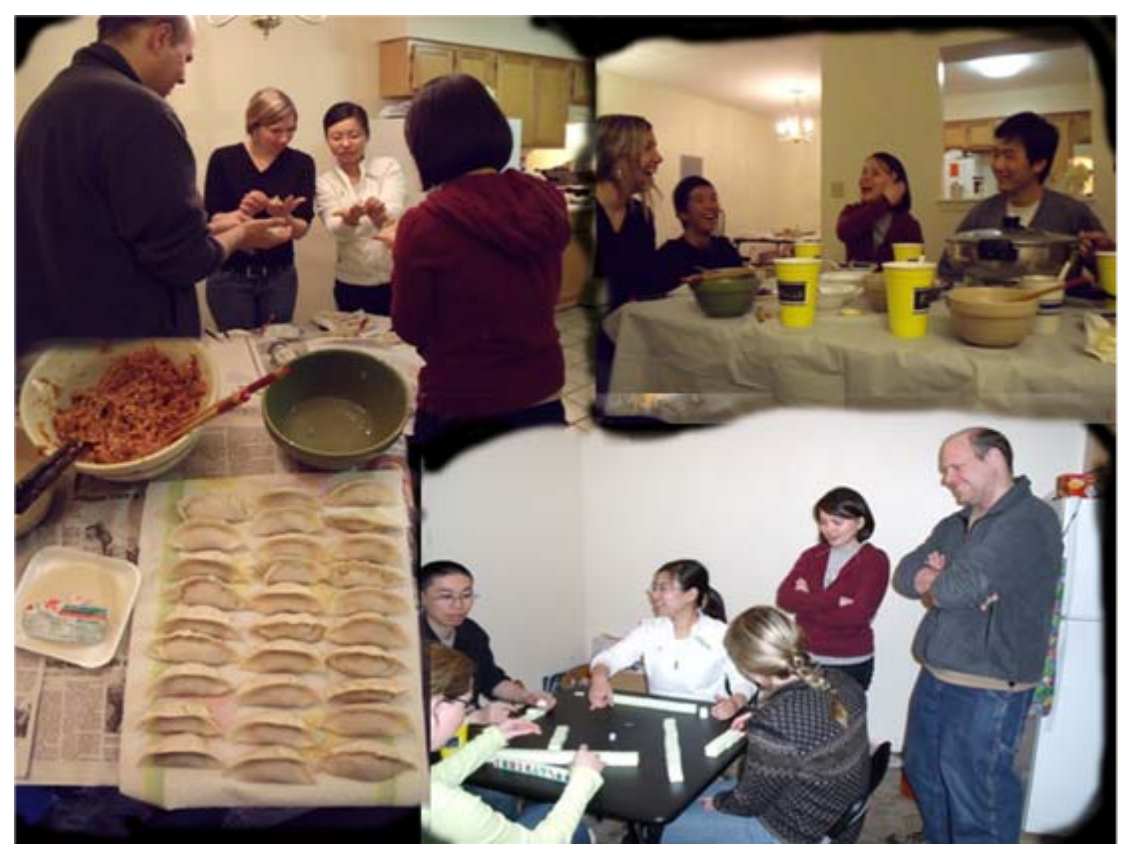
Students at Dumpling Night

Dumpling Night was initiated by several Chinese students in March, with dumplings and hotpot on the menu. An old Chinese saying goes: "those who don't labor don't get to eat". As a result, all the guests invited to the party were required to make their own dumplings from flour dough and dumpling stuffing. And, of course, a brief training was provided to American students in the very beginning. Steamy hotpot was also served with dumplings in case someone failed the training and got really hungry. The party ended with people playing Mahjong, the most popular game in China.