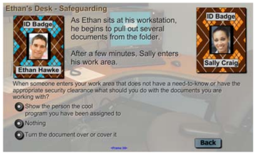
Figure 1 - Security briefing assessment example

The learner is interactively assessed with developmental feedback based on answers to multiple choice questions. Only the correct answer allows the learner to proceed to the next section of the training. The feedback informs the learner by reiterating the content within the context of the situation and characters. For instance, to protect sensitive documents an engineer would need to cover the documents when an unauthorized person enters their office. The instruction simulates that situation and asks the user to make a choice, then informing the learner through feedback on the correct or incorrect answer (see figure 1).