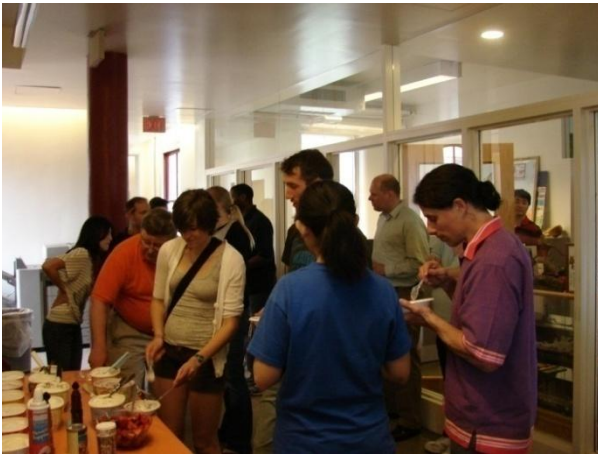
IDD&E Annual Ice Cream Social