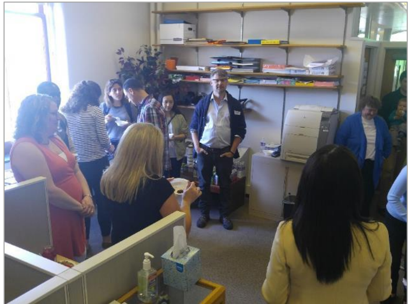
Students at the Ice Cream Social 2018 at IDD&E