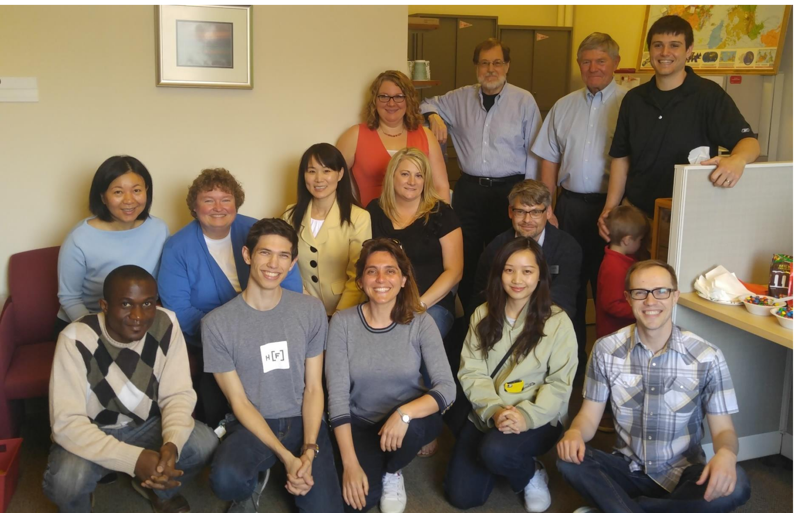
Students at the Ice Cream Social 2018 at the IDD&E Department