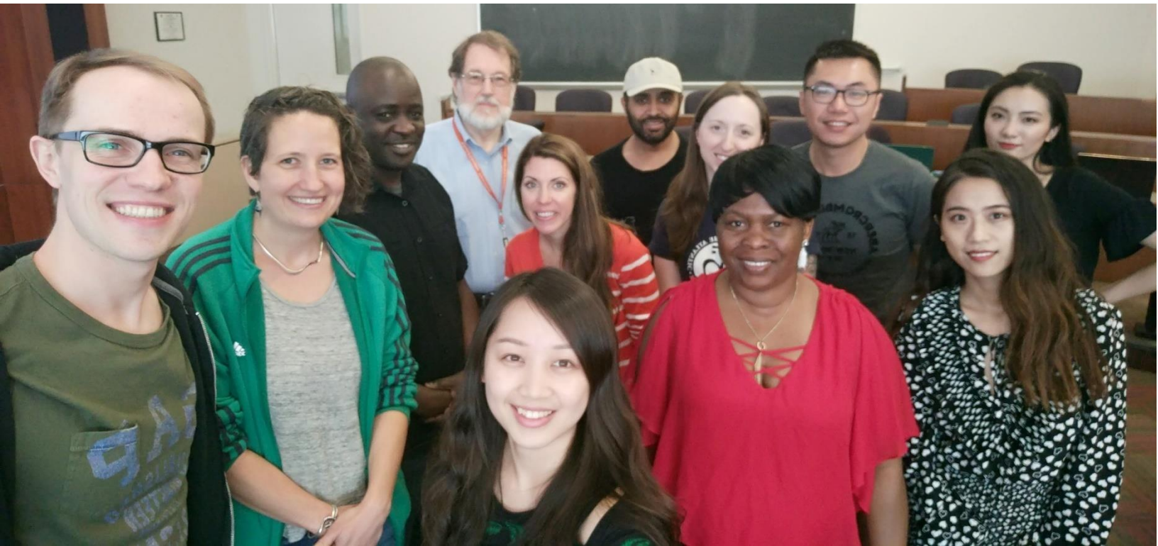
The last class session of IDE 742 Introduction to Survey research, 25 May 2018